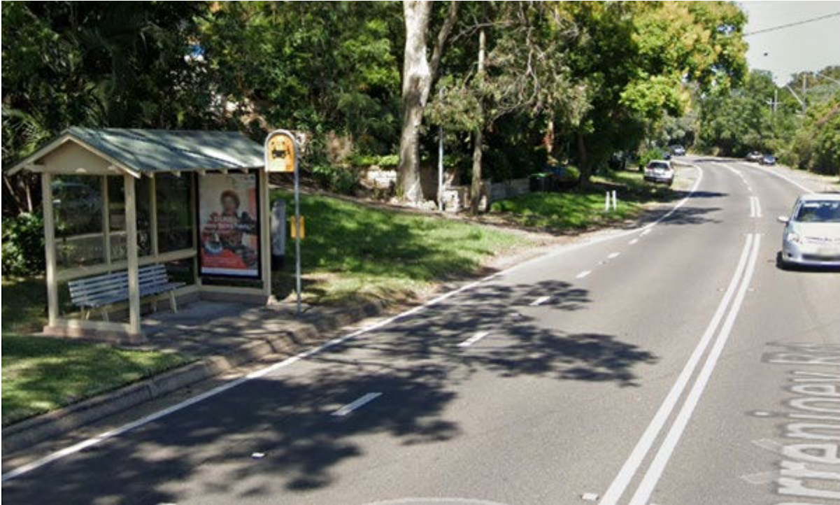
Bus Stop 6 – Barrenjoey Rd, Hitchcock Park