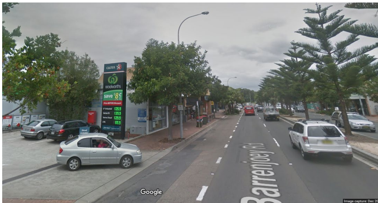
Bus Stop 14 – Barrenjoey Rd, South of Queens Pde East