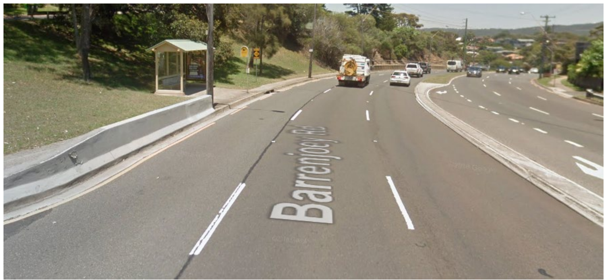
Bus Stop 16 – Mona Vale, Barrenjoey Rd at Kitchener Park