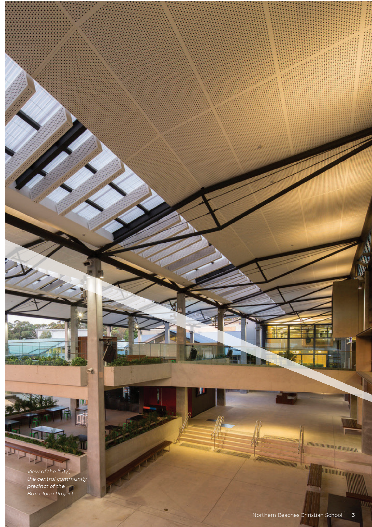
View of the 'City', the central community precinct of the Barcelona Project.

Out of his question grew the 'Barcelona Project', envisioning and creating a stunning, sustainable, open space that now serves as the community 'heart' of the school.