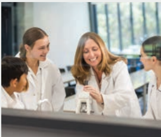
Science teaching and learning has been boosted by the state-of-the-art facilities provided in the new O'Sullivan Science Centre.