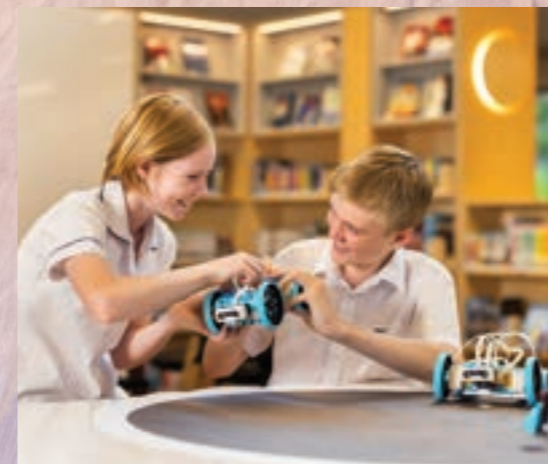
The inviting, light-filled library opened in 2020.