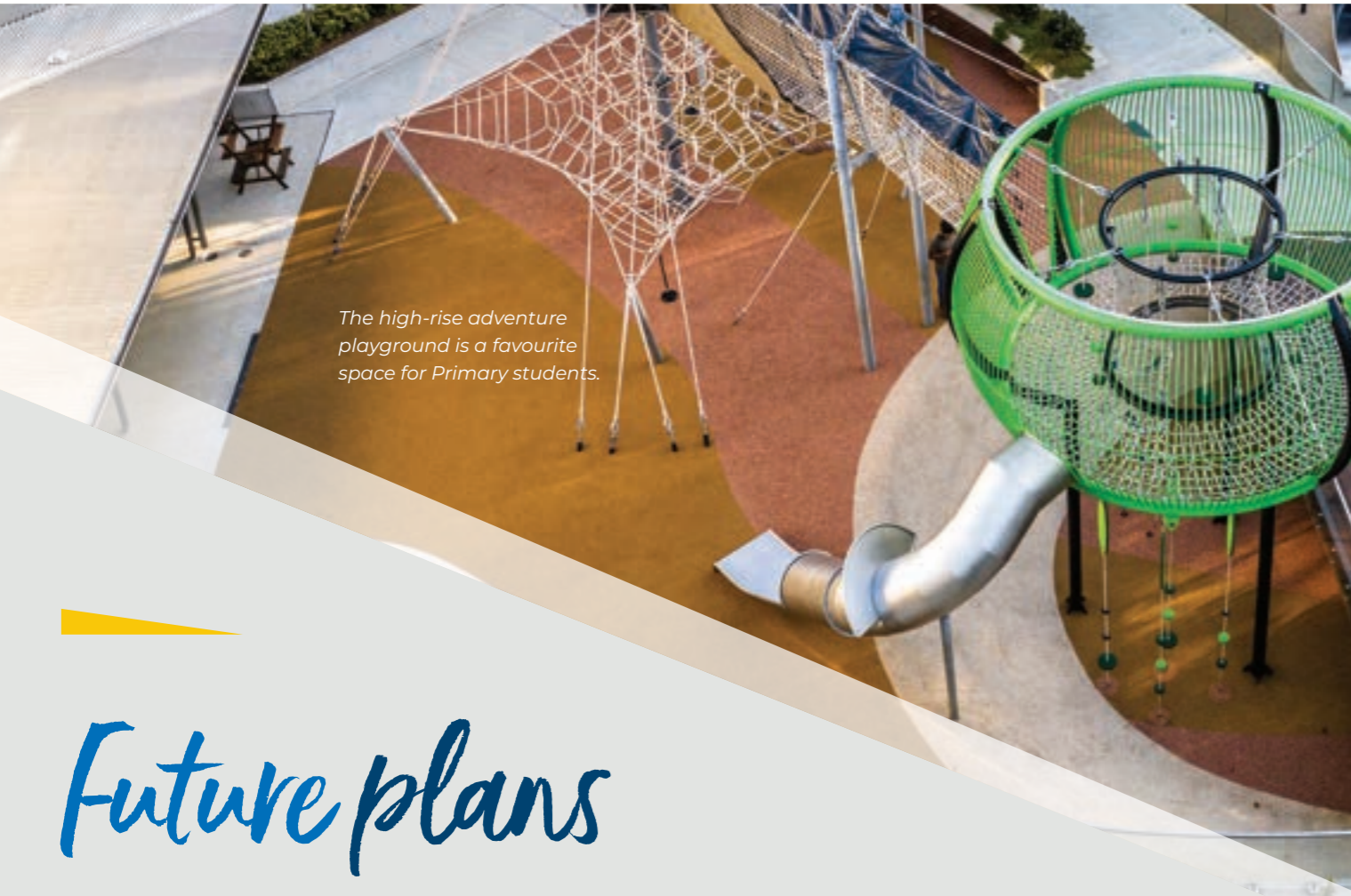
The high-rise adventure playground is a favourite space for Primary students.